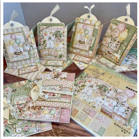
– Twisted Easel Card Set –