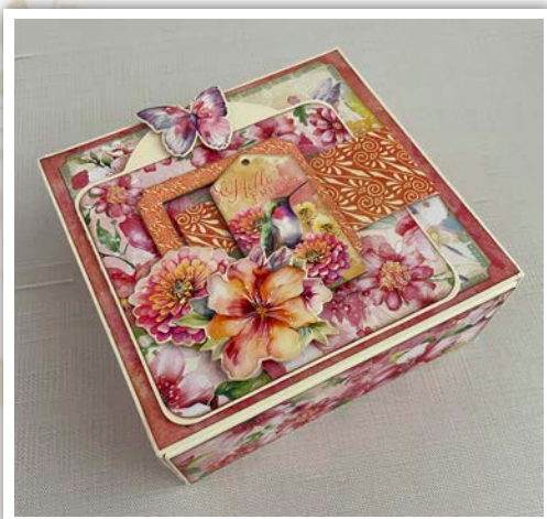
– Flight of Fancy Album in a Box –