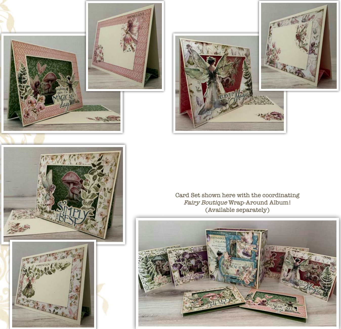
Card Set shown here with the coordinating Fairy Boutique Wrap-Around Album! (Available separately)

You've completed the first three cards of the Fairy Boutique Card Set! An additional three cards can be created using additional supplies in the kit. See the images below for inspiration!